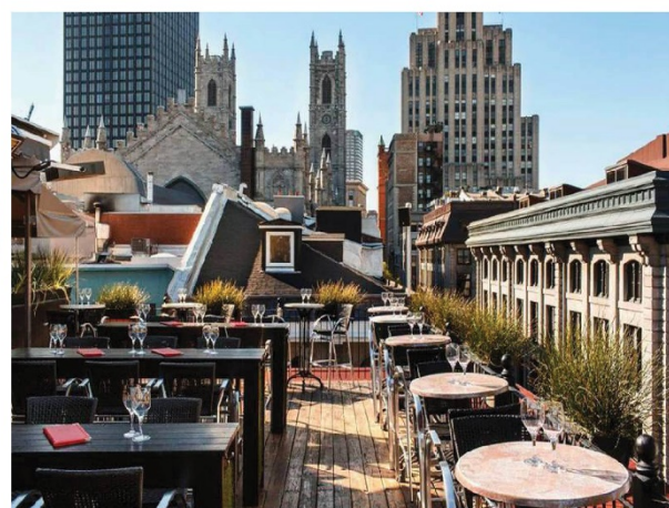
Hotel Nelligan - Private Terrasse 106 St-Paul St West Montreal, Quebec